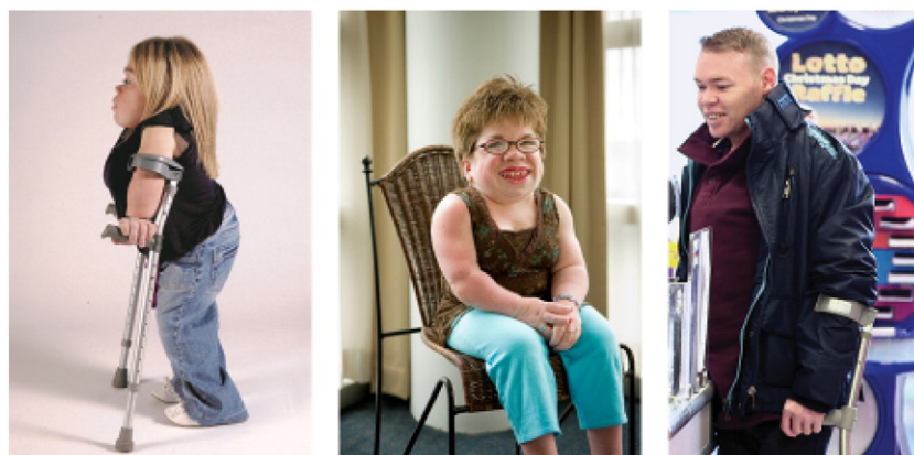
Fig. 1. Typical appearance of adults with severe forms of (left) MPS IVA showing short stature with short trunk and neck, profound skeletal and joint abnormalities and (middle) MPS VI showing short stature, broad or thickened facial features, and small hands showing some clawing. Right: patient with a non-classical phenotype of MPS IVA showing normal stature (reproduced from Hendriksz et al. [6], with permission).

a Described in only four patients to date [2].